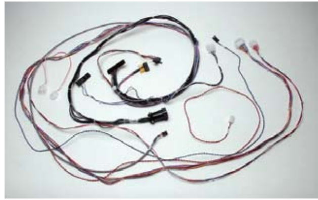
Complex harnessing capabilities