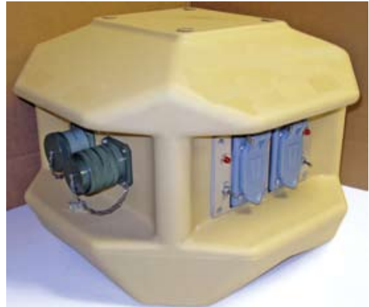
Power distribution unit