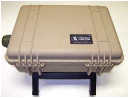
Power distribution unit