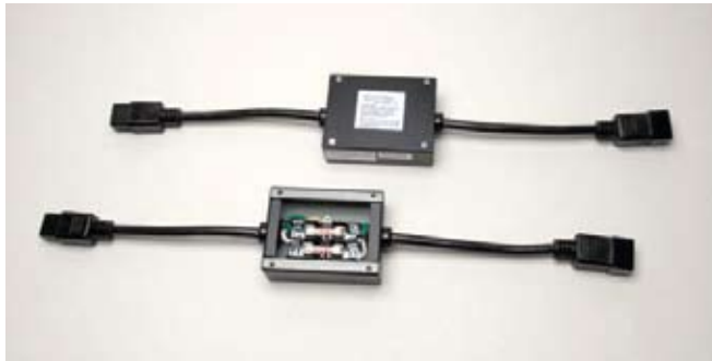
Custom metal fabrication