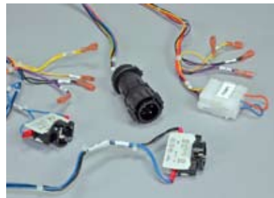
Power cords and harnesses used in medical grade equipment.