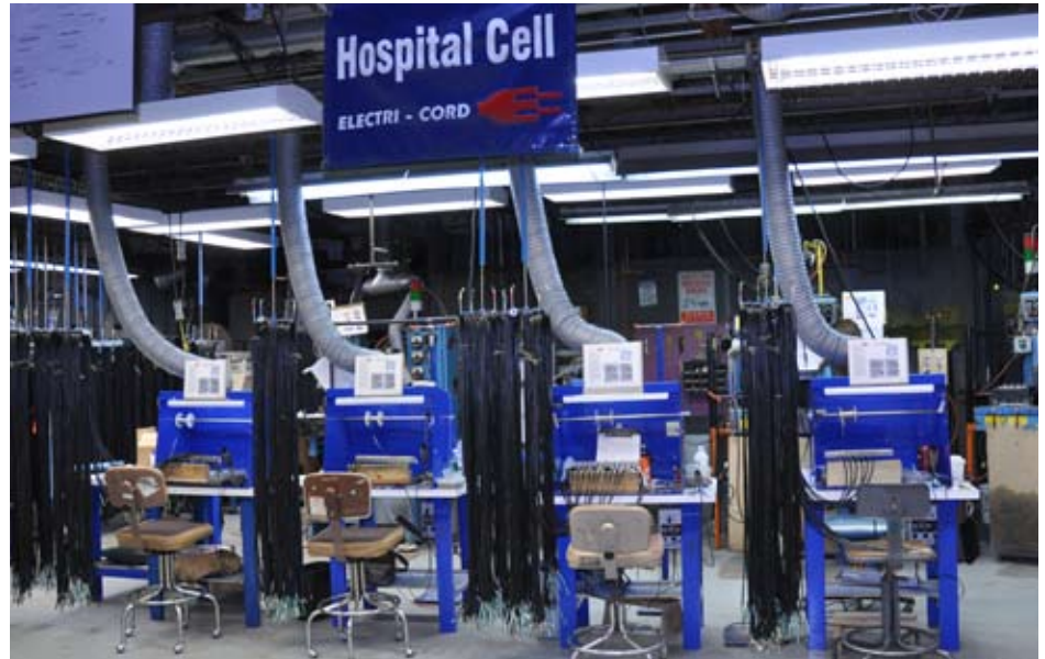
Hospital grade cell at the factory in PA.